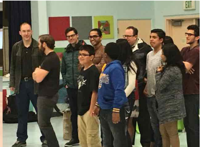
SPARK Mentorship Meeting!